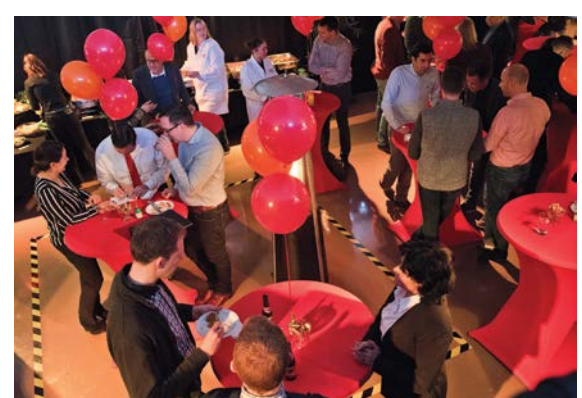
Guests included glass manufacturers and brand owners.